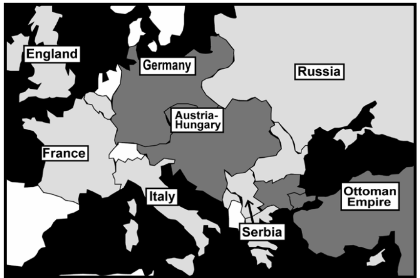
The Balkans ↑

Nationalism ( love for one's nation ) was a powerful force in the Balkans during the early 1900's. People loved their nation so much they were willing to die for it. Many Balkan people were happy to finally be free and wanted to expand their territory . Serbia was one such Balkan nation ( refer to the map above ). Serbia is a nation inhabited by Slavs, who are culturally very similar to Russian people. Serbia wanted to invite all of the other Slavic people that were scattered throughout the Balkans to join them in Serbia. The problem was that Serbia's neighbor to the north, the Austria-Hungarian Empire, was against this idea. Austria-Hungary had many Slavs living in their nation, and they feared there would be a rebellion among the Slavic people in Austria-Hungary. Russia, the other major power in the area, supported Serbia's plan. After all, Russians are Slavic, and they would be happy to see a Slavic nation like Serbia become powerful. In addition, control over the Balkans would protect Russia's trade routes on the Mediterranean Sea. This conflict of interests created a very tense situation in the Balkans. Any sudden action by these nations could easily have led to war.