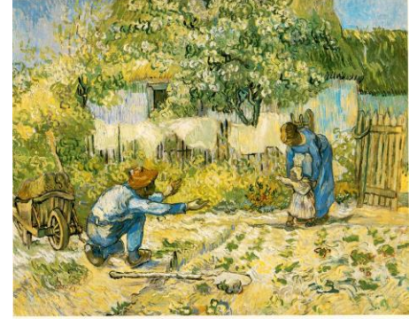
EXAMPLE: "First Steps", 1890, Vincent Van Gogh

In this section you must insert a color photo of the artwork you chose clearly inserted into your project. The name of the artist, the name of the artwork, and the year it was made should appear below the picture. To insert a picture into Microsoft Word, first find the picture you want (full size) on a webpage and save it to the desktop of your computer. Then on Microsoft Word, go to "insert" at the top and select "picture" (or you can just drag it into Microsoft Word from the desktop of your computer). Then resize the picture so it is large enough. If you need help with this ask me or a tech savvy friend!