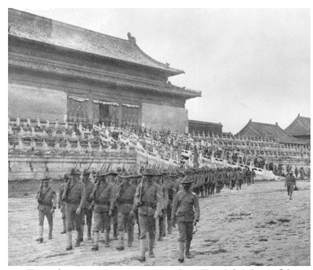
Foreign troops enter the Forbidden City

The Boxer Rebellion, like the Opium war before it, was an excuse for the imperial powers to take advantage of China. The humiliation China suffered as a result of this foreign defeat would lead to strong Chinese nationalism and a great desire for Chinese independence in the 20<sup>th</sup> century.